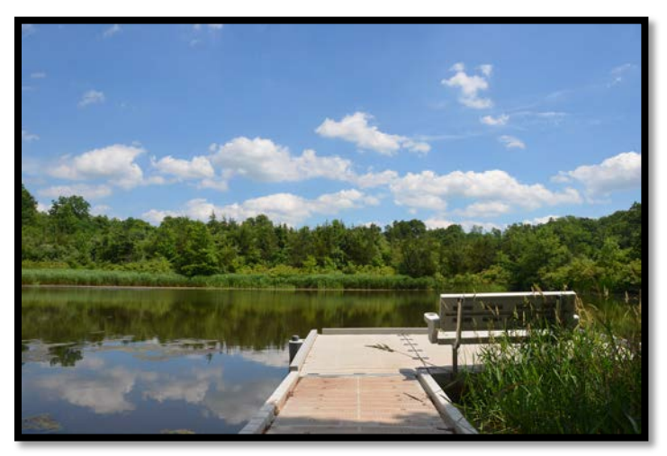
Pond at Fairview Farm in Bedminster, Somerset County

Raritan Headwaters Association is a 501(c)(3) non-profit organization that was formed from the 2011 merger of the South Branch (SBWA) and Upper Raritan (URWA) watershed associations.