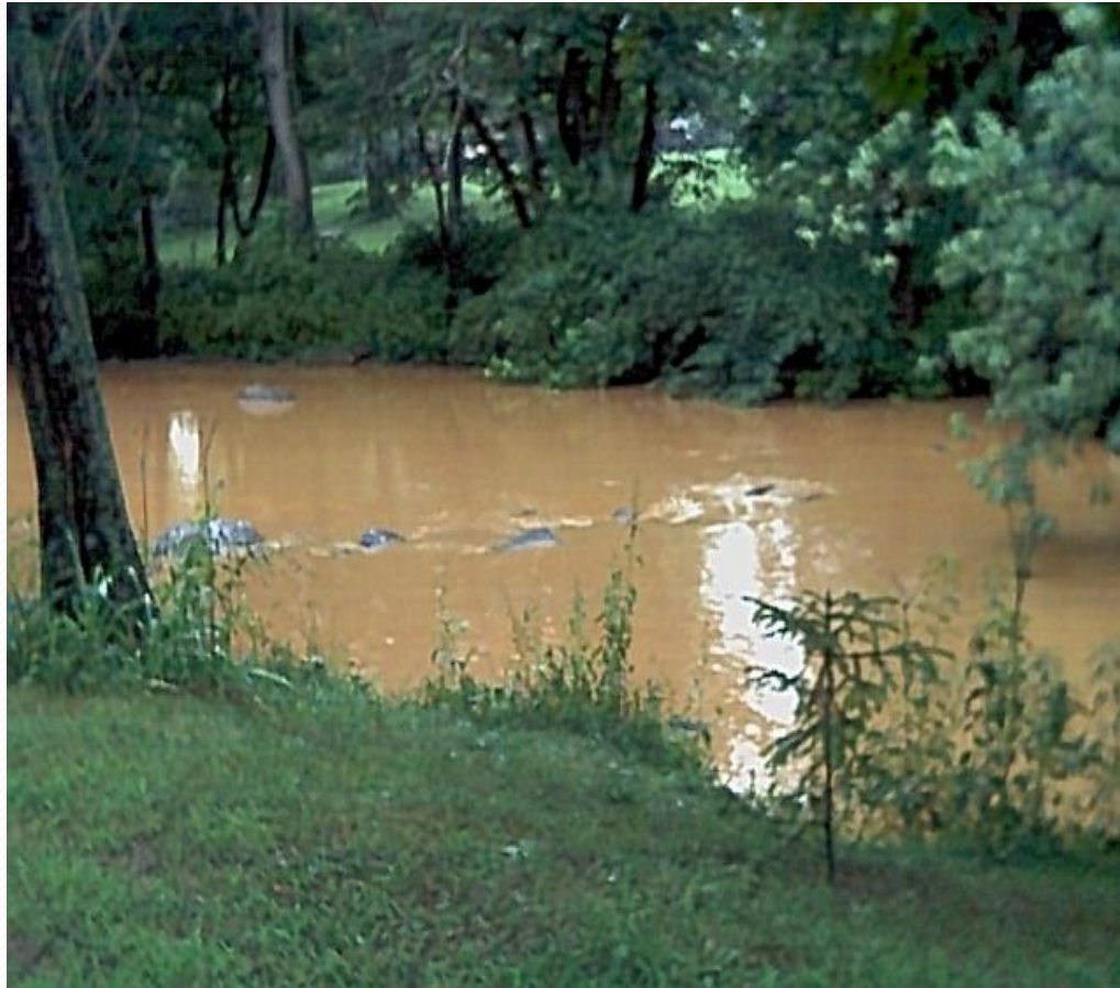
South Branch, Raritan River, May 2019