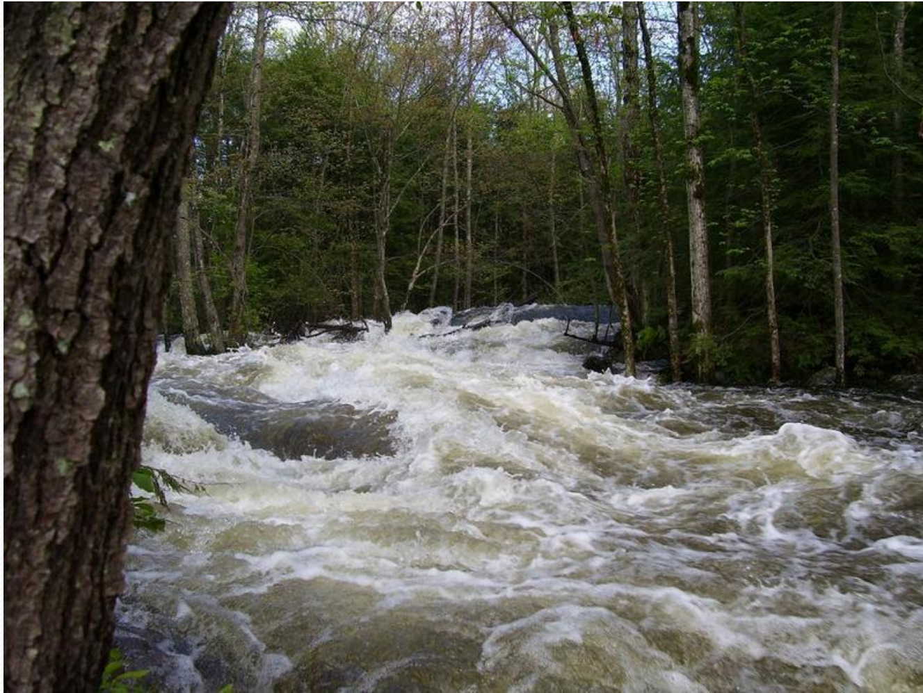
South Branch, Raritan River, Hurricane Irene, October 2011