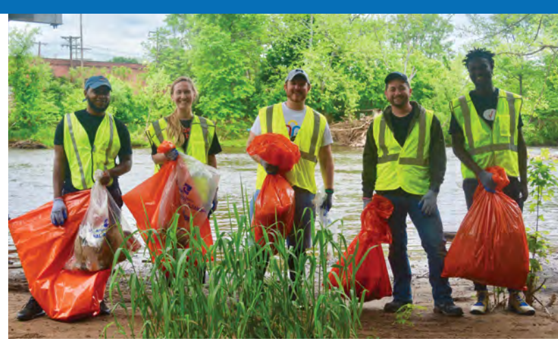
Over 1,000 volunteers, in one morning removed 11 tons of trash from 50 miles of stream at RHA's 2022 Annual Stream Cleanup.

This year RHA partnered with 24 schools! Our education team welcomed hundreds of students to Fairview Farm, led in-school programs, river explorations, and more opportunities for fun in nature!